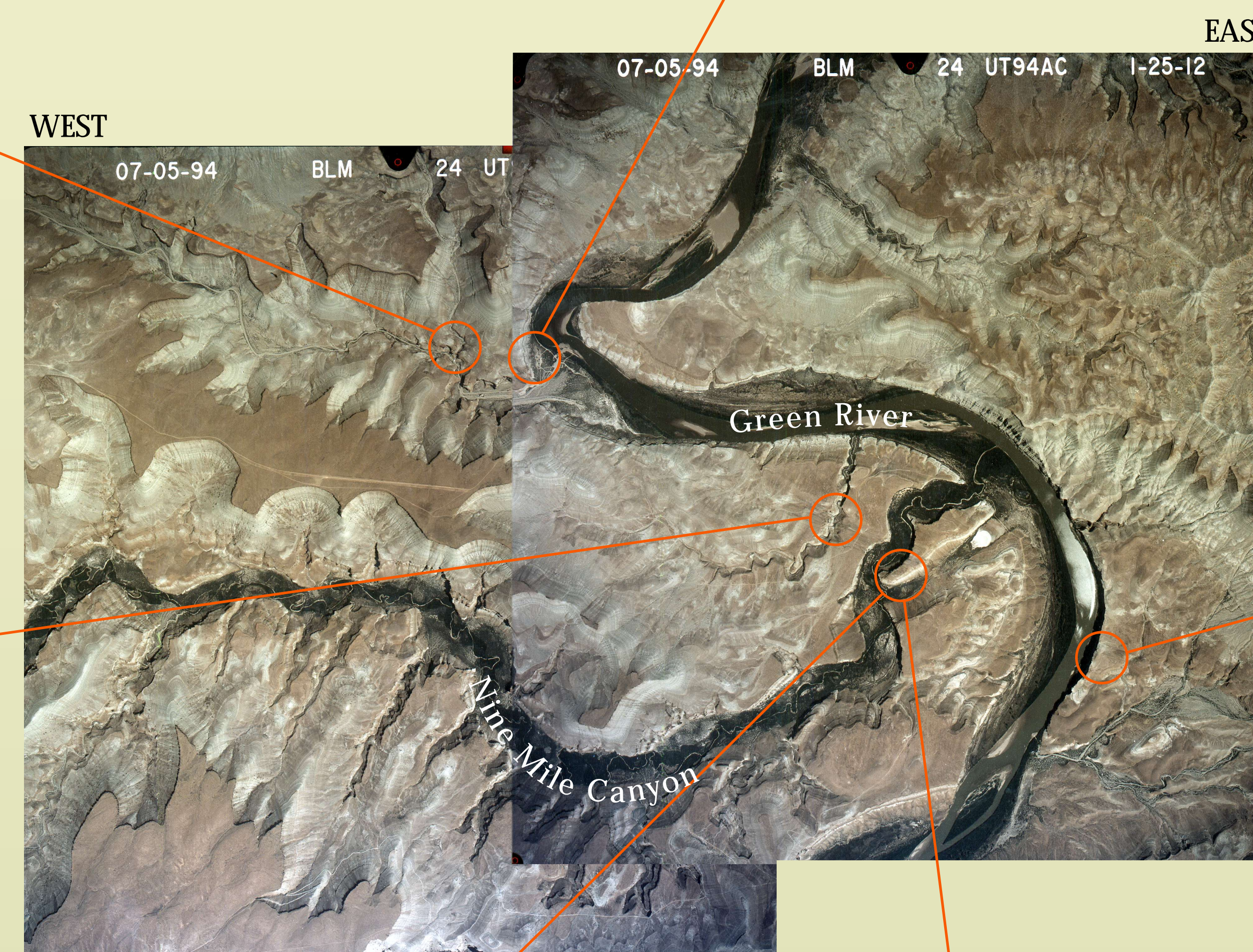
Air photos of the Sand Wash and Nine Mile Canyon area, tributaries to the Green River at the head of Desolation Canyon