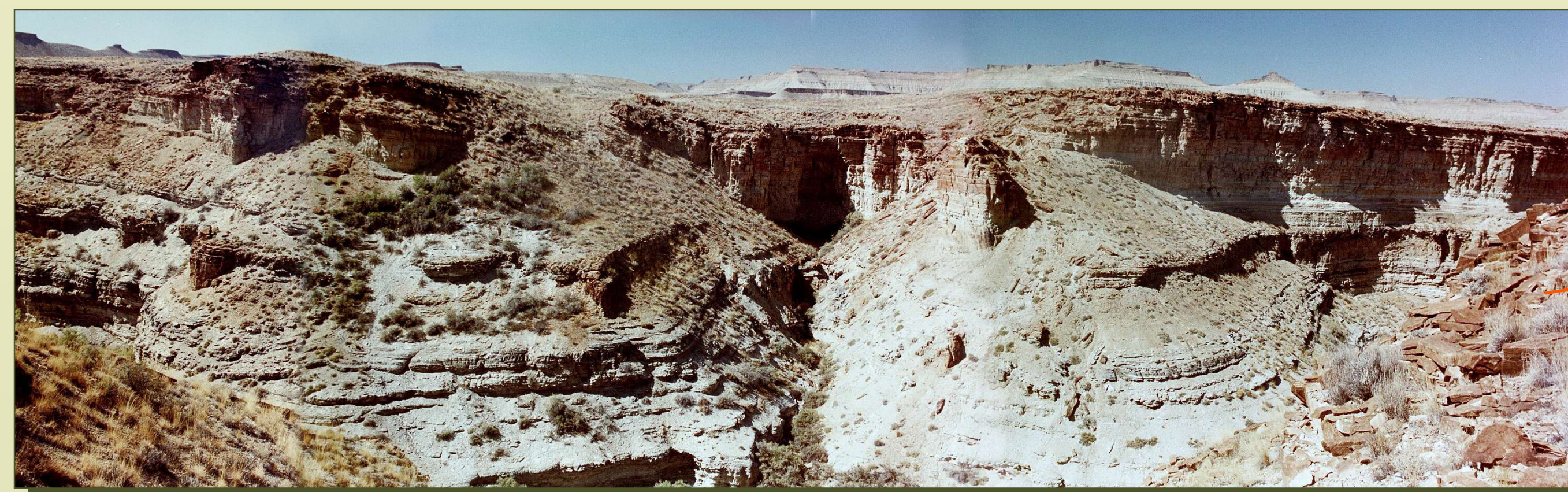
Figure 4. Looking northwest.