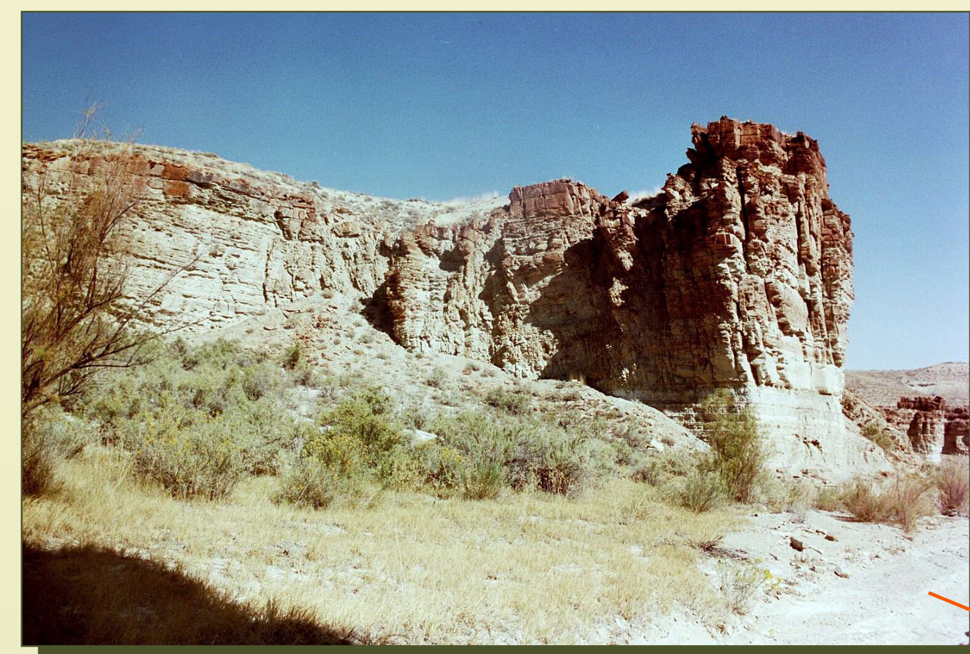
Figure 5. Looking east from the Sand Wash road, graben parallels the road.