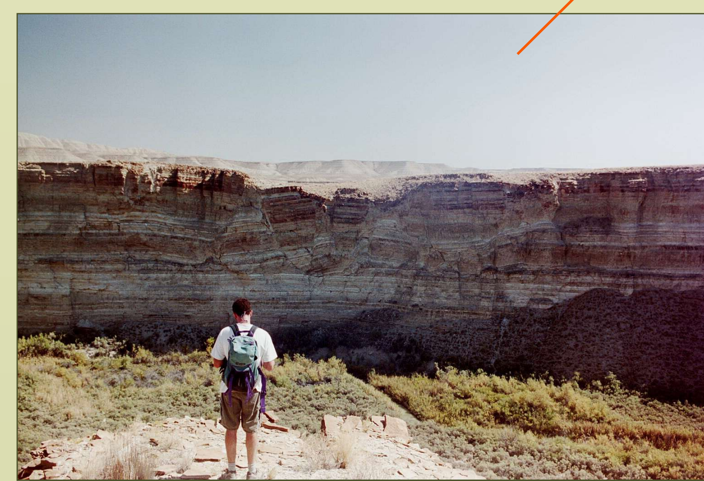
Figure 3. Looking southeast across Nine Mile Canyon.