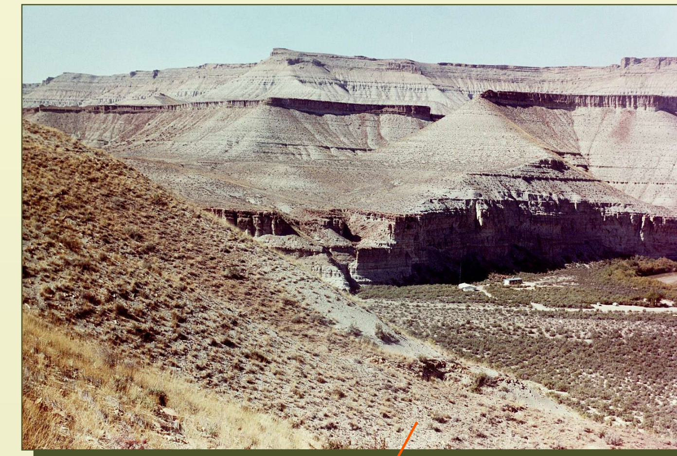
Figure 6. Looking northwest towards the Sand Wash BLM Ranger Station, graben is in the cliff above and to the left of the BLM station.