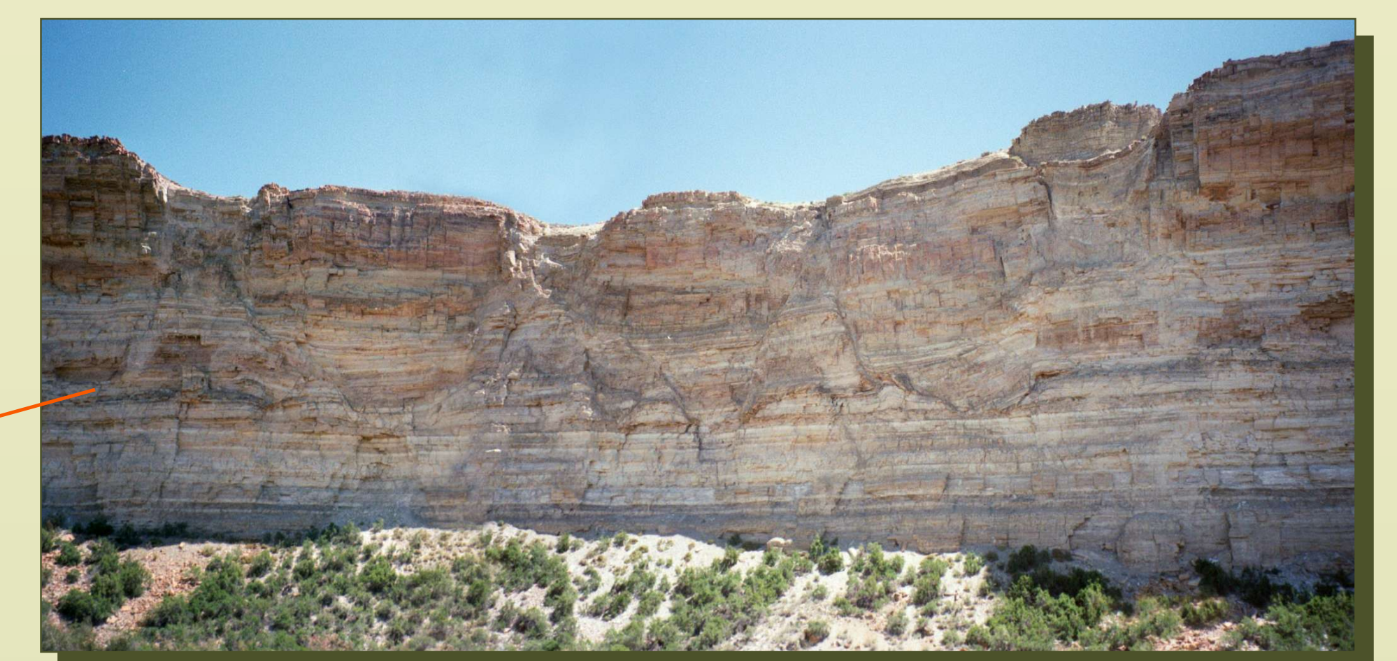
Figure 1. View from the Green River looking east.