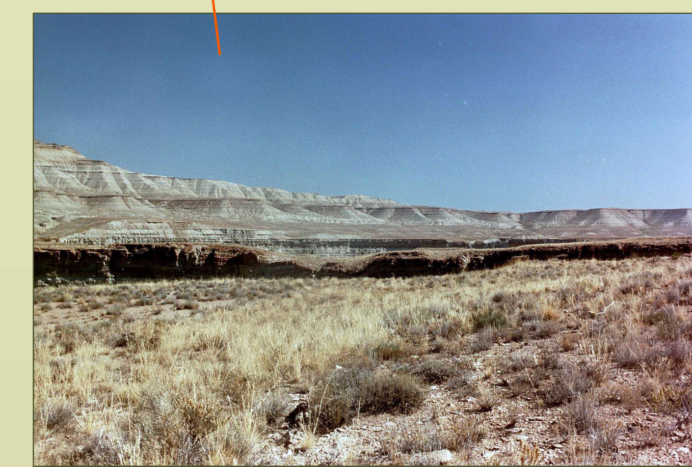
Figure 2. Looking southeast at the graben in Nine Mile Canyon (figure 3), behind it you can see the graben along the Green River (figure 1), and in the hills in the background.